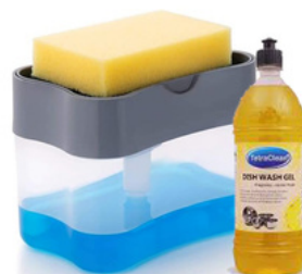
Dish Wash + Gel

Note : The images show are for illustration purposes only and may not be an exact representation of the product. Actual device may different from the image show.