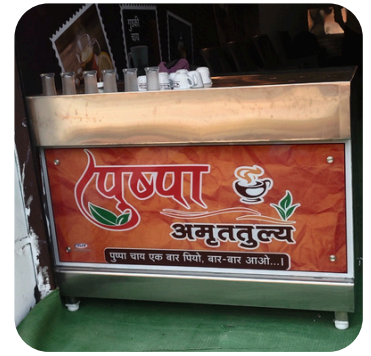
Serving + Cash Counter