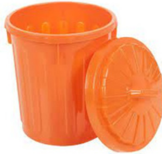
Small Dust Bin 1