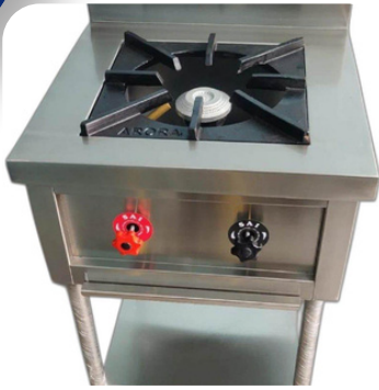
Steel Bhatta (Sigadi)