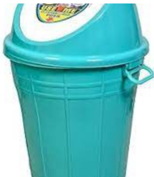
Big Dustbin 1