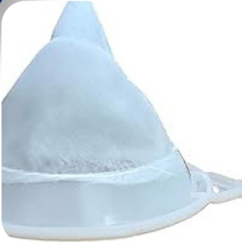
Big Chay Channi