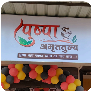
Main Board (Simple)