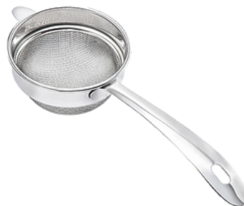
Chay Channi 1