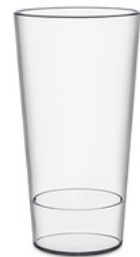
Acrylic Glass 5