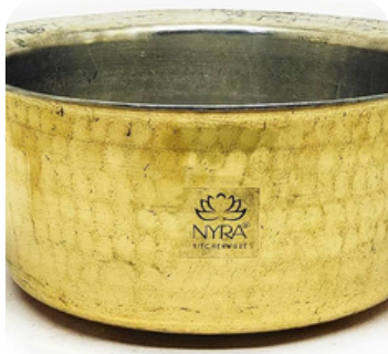
Pital Ganj 2